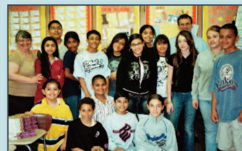
Middle School kids choose to give back.

Chess-in-the-Schools was at the top of their list of deserving organizations that impact their lives.