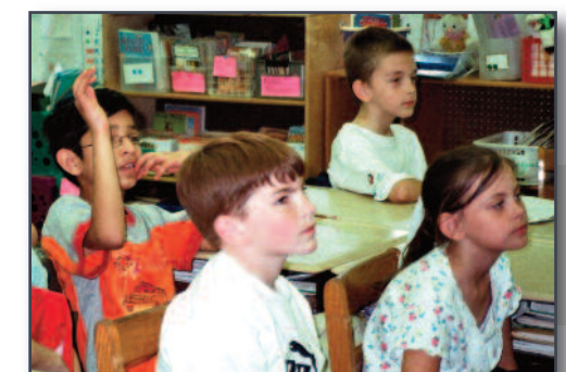
PS 87Q students listen intently to their chess lesson.