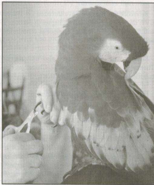
Picasso sits calmly for a nail trim.

Picasso, my young, healthy Scarlet Macaw used to go regularly to the veterinarian for a routine nail clipping until one of those sessions resulted in a near death experience. Wrapped in a towel, he screamed and struggled, as the veterinarian clipped away at his bleeding toenails, and dabbed them with styptic. As I watched, Picasso's body went limp, his eyes went dim and rolled back into his head, and he stopped screaming. Before I could say a word, the veterinarian threw him on the examining table, and quickly resuscitated him by pressing repeatedly on his little chest. It's difficult to describe my fear and feelings of helplessness as I watched him wilt before my eyes, and then later to hold his weakened body in my arms. He was unable to stand or grasp anything with his feet for over an hour. His breathing was labored and he honked with every exhale. It was this one chilling experience that convinced me that no matter how hard it would be, and how long it would take us to do it, Picasso and I would have to learn to trust each other enough to do this job ourselves. I didn't realize at the time that my relationship with him would move to another level as we achieved this goal.